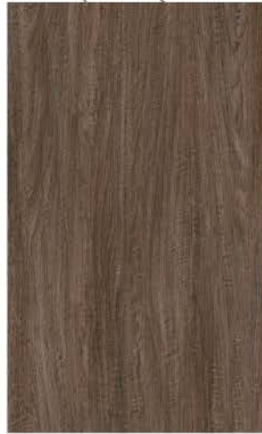
AGT - PALMERO 504