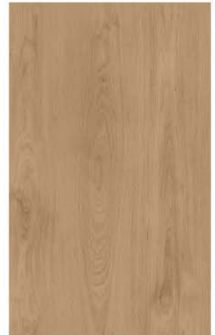
AGT - NATURA OAK 204