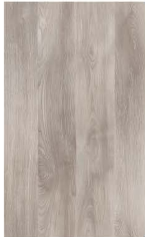
AGT - FLORIDA 915