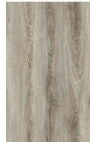
AGT - SILYON OAK 206