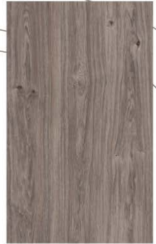
AGT - MAPPA 1005