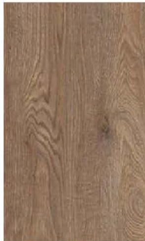
AGT - PAMIR 906