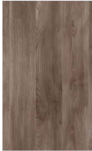
AGT - PANAMA 918