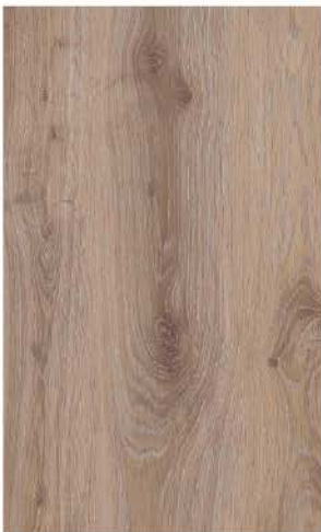
AGT - ALARA OAK 205