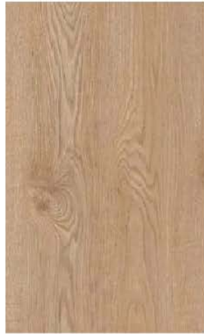
AGT - URAL 907