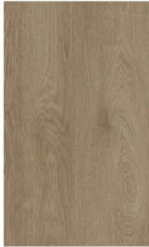
AGT - SOLARO 912