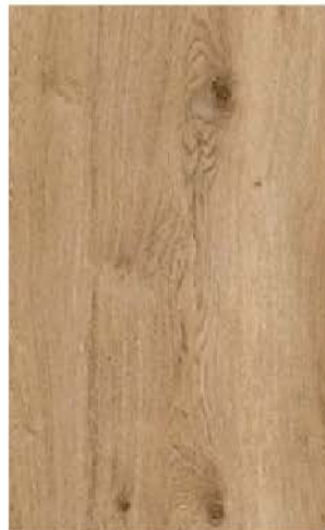
AGT - MODERNA 228