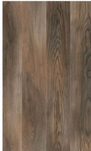
AGT - AZOR 920