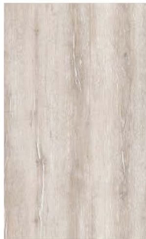
AGT - CANYON OAK 201