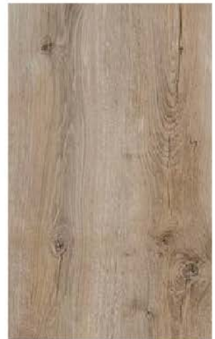
AGT - MERIC 506