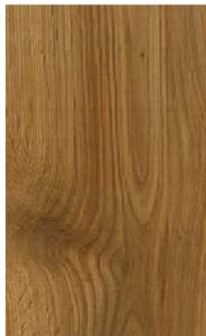
AGT - MANTRA 930