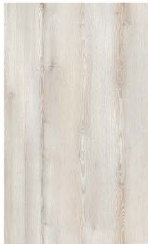
AGT - ANTALYA PINE 022