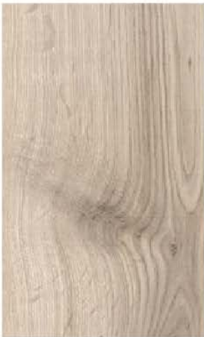
AGT - NIDRA 929