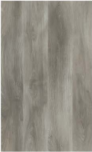
AGT - SAMOA 916