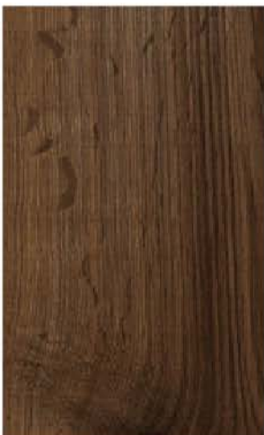
AGT - PRANA 928