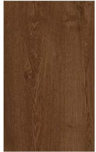
AGT - TALYA 508