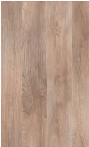
AGT - LABRADOR 922