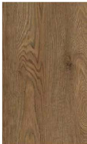
AGT - ATLAS 913