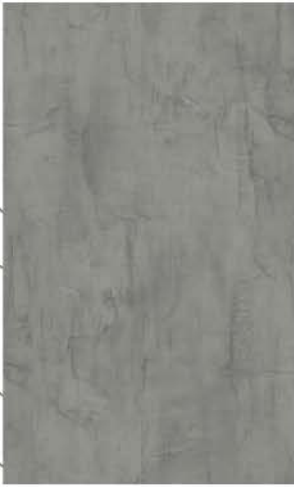
AGT - MALTA 1003